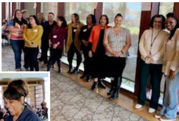
Honorees lining up to receive awards