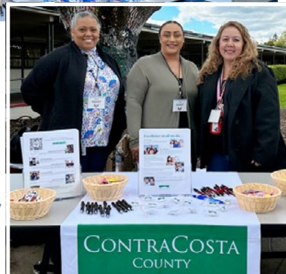
Right: The same crew tabled at Clayton Valley Charter High School's career fair, Thursday, March 30.

Students were happy to share their 'after graduation plans' with the group and learn about how EHSD could fit into them.