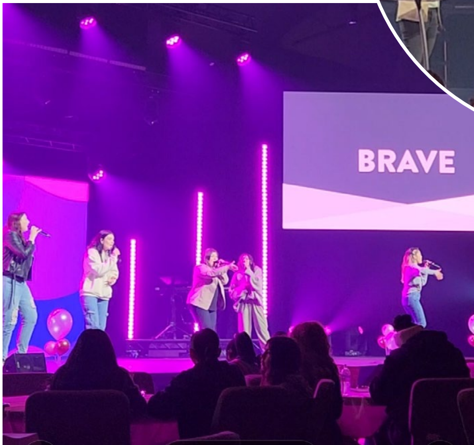
Brave Conference at Bay Church in Concord