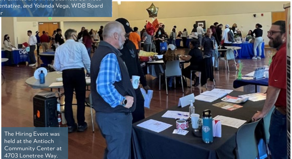
The Hiring Event was held at the Antioch Community Center at 4703 Lonetree Way.